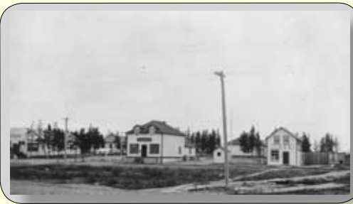
Gillam Manitoba, 1931 #000045