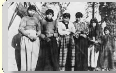
"Indian" women, possibly family of guides/workers for proposed HBR route 1908-1909 #000063