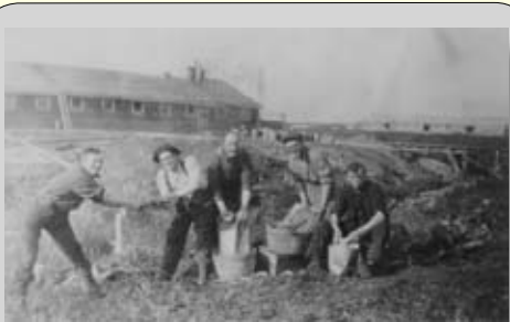
Wash Day at Camp Fort Nelson, MB, ca. 1914 #000124