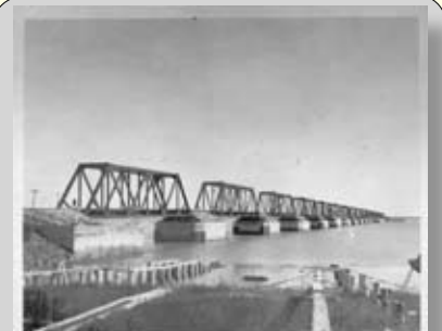
No Sign of ice or storm damage, bridge at Port Nelson, 1924 #000188

Samples of images that might be used are shown throughout this brochure.