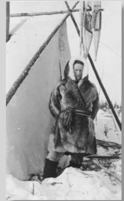
Surveyors' Camp, Hudson Bay Railway proposed route, Survey Party #4, Manitoba 1908-1909 #000114

Frontier School Division Photo Archive Project* 2007