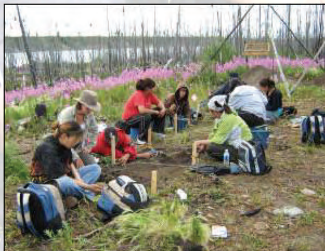
Students excavating at the Weir River site