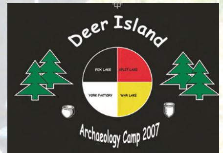
Logo designed by Bailey Saunders (York Landing)

a lab component, where the students participated in the initial cleaning and processing of the artifacts.