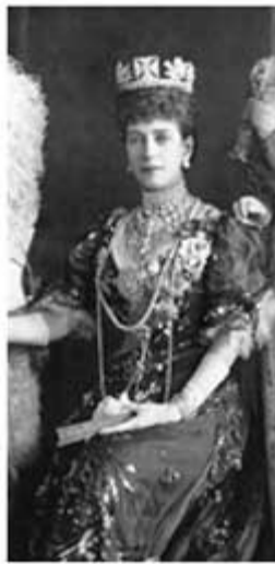
Queen Alexandra, ca. 1905

This afternoon we went to the show. Queen Alexandra was there. 44 Our seat was quite close and once I caught her eye. She keeps her age wonderfully well.