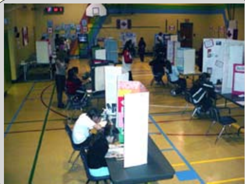
Participation in Heritage Fairs, such as this one at Cranberry Portage Elementary in 2004, is strongly encouraged throughout the Division.

In addition, the mandate of the SS/NS Department also includes support for and promotion of aboriginal languages.