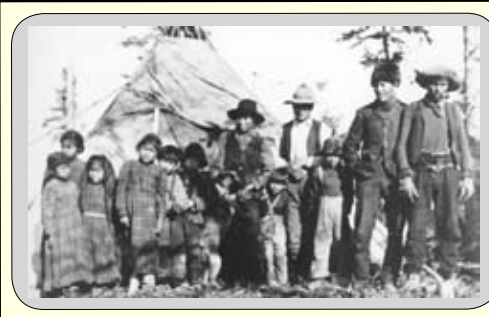
"Indians" - possibly assisting survey party #4 on HBR, 1908 FSD Photo Archive, #000064 (Source: Library & Archives Canada, PA147454)