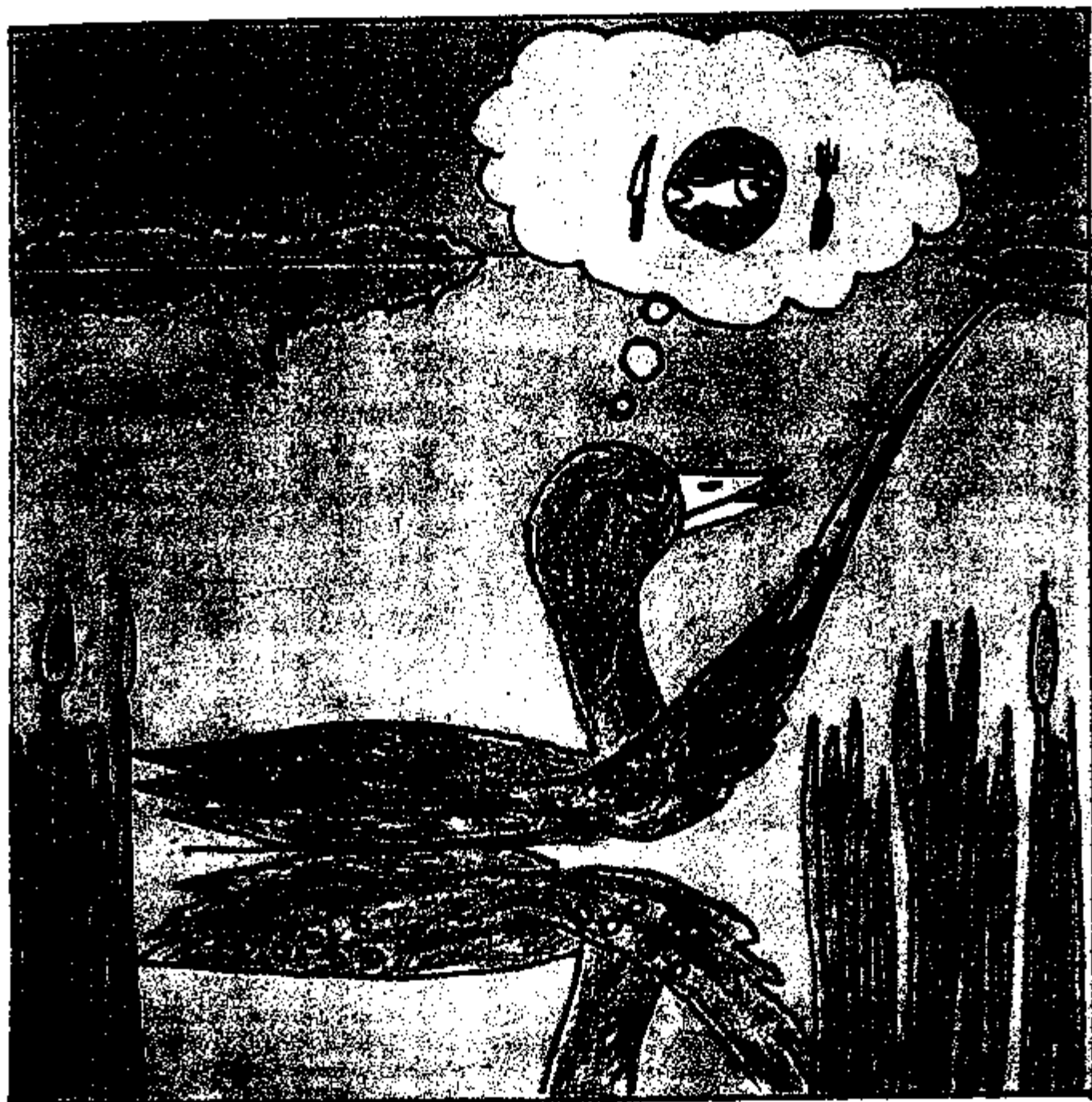
Loons on the lake. Mwàkak sàkahikanihk ᐱᐱᐱ ᐱᐱᐱᐱᐱᐱᐱ