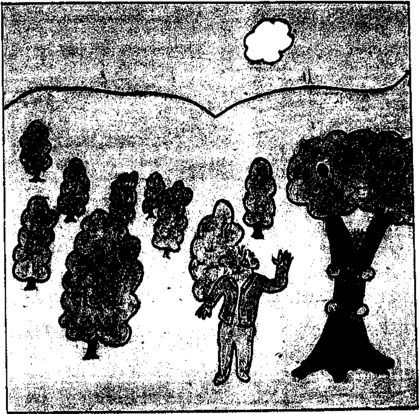
Bears in the bush. Maskwak nòhcimihk ᐱᐱᐱᐱᐱ ᐱᐱᐱᐱᐱ