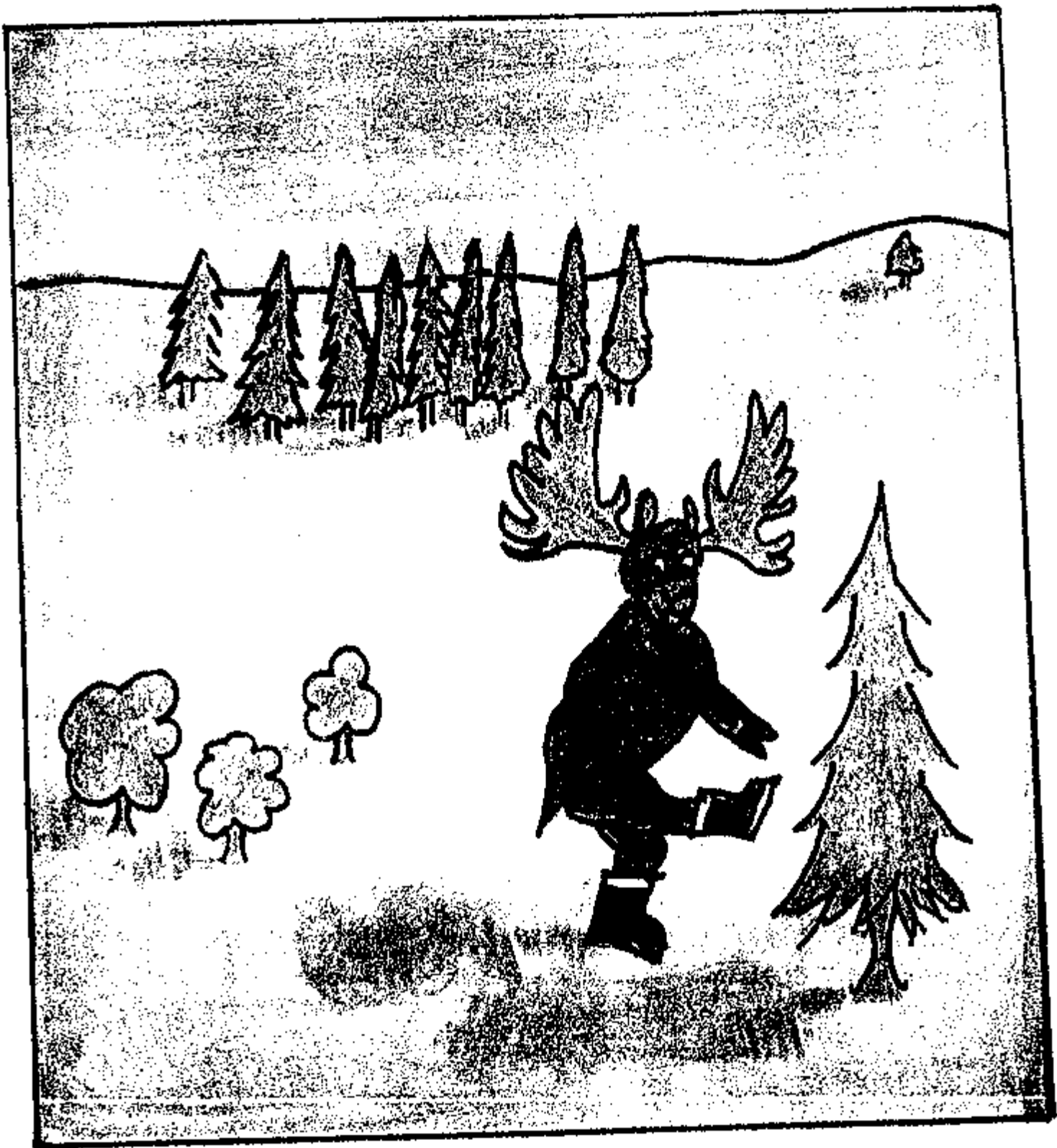
Moose in the muskeg. Moswa maskèkohk ᐃᐅᓄᐅ ᐅᓄᓄᐅ